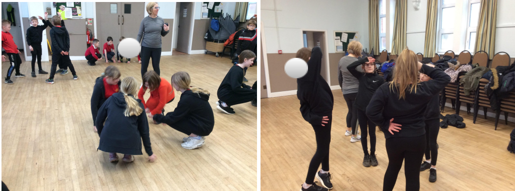
Class 3 Dance lessons in the hall

This week Year 6 have been doing SATs practice assessments and some of them met with LHS teachers as the next part of their transition to the next phase of learning. On Thursday the Open the Book team came in to take assembly. We have also started a unit of work on writing a brochure to persuade people to holiday in Sicily. We had a bit of fun on Wednesday as we imagined our flight out to Sicily and what we might see as we landed. We even had the preflight safety talk. In Wednesday's PE lesson we were practising our racket and ball control skills and on Friday we should hopefully be starting to sew our stuffed animals. If anyone with a current CRB would like to come in for the last hour on a Friday to assist with sewing I would be very grateful as it will speed the process up considerably. The planned visit of our local MP has been postponed until next Friday morning, but that gave a chance to catch up on what we missed on the snow day.